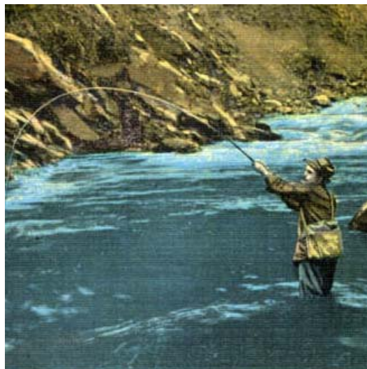
Featured State Symbol [7]