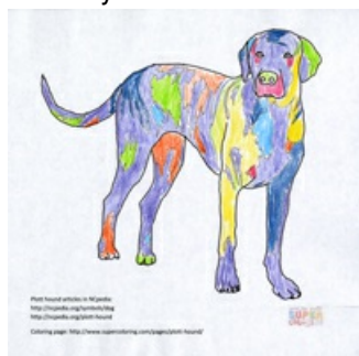
State Symbols Coloring Pages [10]