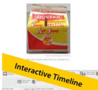
State Symbols Timeline [7]

To read entries about many of North Carolina's most well-known state symbols and the history of North Carolina in Spanish, visit this NCpedia link: https://ncpedia.org/libro-de-hechos-de-el-viejo-estado-del-norte [6]