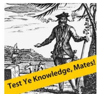
Take a NC History Quiz! [8]