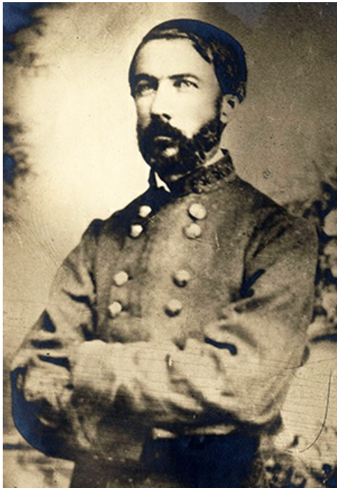
A photograph of Daniel Harvey Hill in confederate uniform.

New Bern and Washington. Recalled to defend Richmond during the Gettysburg campaign, he was promoted to lieutenant general (from North Carolina) on 11 July 1863. He was then ordered to the Army of Tennessee. In the Confederate victory at Chickamauga he commanded a corps. But his recommendation to President Jefferson Davis that Braxton Bragg [11] be removed from command on the ground of incompetence prompted the president to relieve Hill instead. Furthermore, Davis refused to send Hill's commission to the Senate for approval. Thus he served as a lieutenant general for only a short period (19 July–15 Oct. 1863) while Congress was not in session. Except for a short stay in Petersburg in 1864, Hill saw little further service until the closing stages of the war. At Bentonville [12] , N.C., in March 1865, he commanded, as a major general, a division in Joseph E. Johnston's small force.