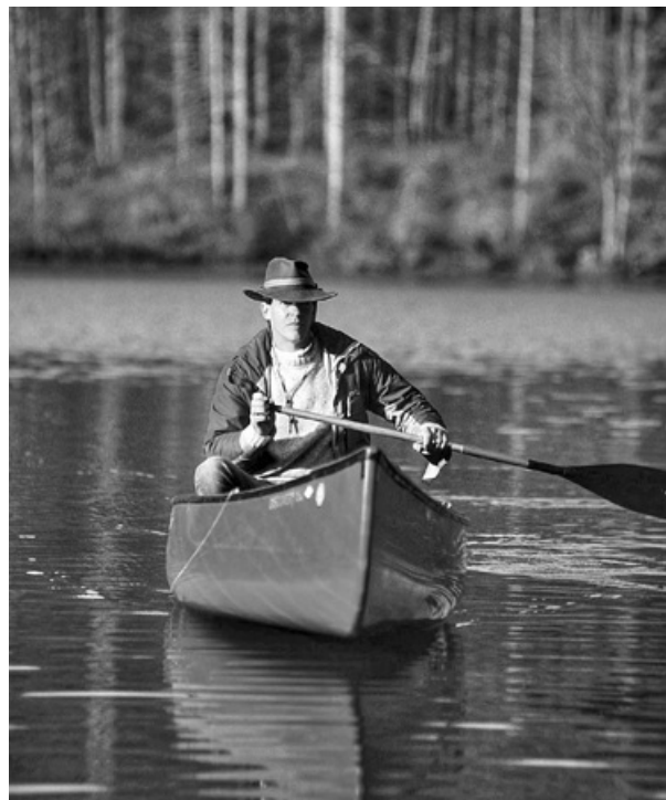
Canoeing at Umstead State Park near Raleigh.

Between the years 1934 to 1941, North Carolina's early parks experienced a period of rapid development through Depression [10] -era New Deal [11] programs such as the Civilian Conservation Corps [12] and the Works Progress Administration [13] . Following the end of World War II [14] , high public demand for recreation facilities spurred continued growth of the state parks system and the expansion of the Branch of State Parks into a separate Division of State Parks in 1948. Since 1969, the state parks system has mushroomed in size thanks to the easing of former legislative restrictions on acquiring land for new state parks.