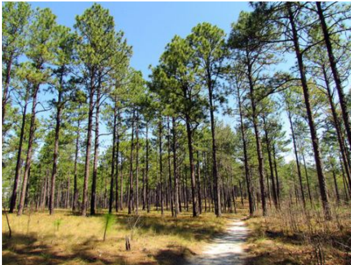
"Forest - longleaf pines Weymouth Woods SP 1805." 2011.

[5] The conservation movement in North Carolina began with methods of maintaining the timber supply and restrictions on wasteful colonial hunting [6] practices. Some eighteenth-century North Carolinians noted the effects of wasteful practices upon wildlife [7] and timber; consequently, North Carolina lawmakers established a closed hunting season on deer in 1738, and in 1768 they restricted deer hunting to owners of large tracts of land. The early exploitative timber harvests in North Carolina began with the domestic need to clear land. The naval stores [8] industry found a center in the abundant longleaf pine forests of eastern North Carolina. After the War of 1812 [9] , the state became the center of the turpentine industry. North Carolina was the largest resin gum producer in the South in 1880, producing 6.3 million gallons of turpentine and more than 650,000 barrels of tar. The wasteful turpentine harvest stunted the growth and quality of thousands of square miles of young pines [10] .