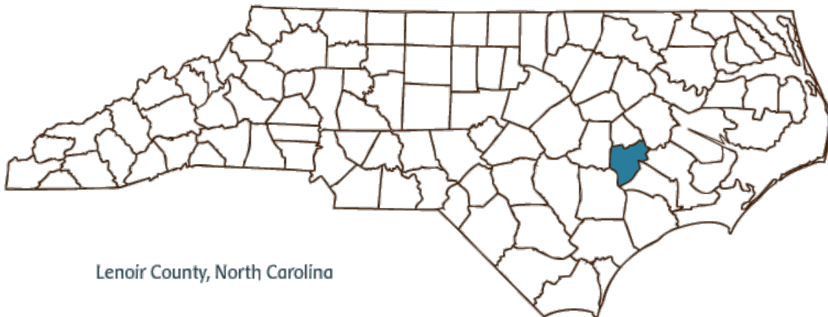
Lenoir County, North Carolina

NEIGHBORING COUNTIES: Craven [9] , Duplin [10] , Greene [11] , Jones [12] , Pitt [13] , Wayne [14]