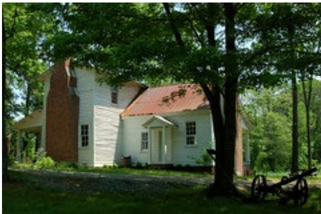
May 7, 2008. "Mendenhall Plantation."

Today few people know the story of the antislavery movement in North Carolina, even though one of the era's most famous activists came from the state. Levi Coffin [5] (1798–1877)—who became known as "the President of the Underground Railroad" for his determined and vocal campaign against slavery—grew up in the New Garden Quaker community of Guilford County [6] . Although Quakers [7] —members of the Religious Society of Friends, a Christian group—opposed slavery, people disagreed over the best way to express that opposition and help those who were enslaved. Helping runaway slaves was a criminal act with severe penalties. Many Quakers drew the line at breaking the law.