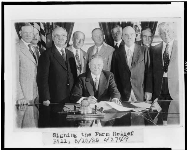
"Herbert Hoover signing the Farm Relief Bill, with nine other men standing alongside and behind him." June 15, 1929.

While the federal government under President Herbert Hoover's [9] administration attempted to provide some work and financial relief, the effects of the Depression nonetheless worsened from 1929 to 1932. Clearly, more drastic measures were required to avert further tragedy. Amidst these circumstances Franklin D. Roosevelt [10] was elected president in 1932, and with his inauguration the New Deal [11] was launched in 1933.