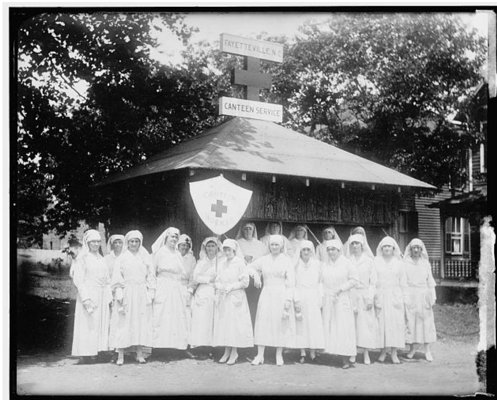
Fayetteville, N.C. Canteen Service. [Date created/published between 1910-1920].

See also: Great Depression [2] ; Public Schools in the Great Depression [3] ; 1920's [4] ; Agriculture During the Great Depression [5]