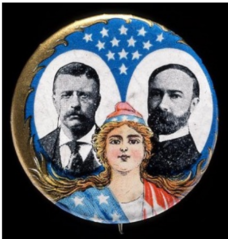
Button for the 1904 Roosevelt/Fairbanks Republican presidential campaign.