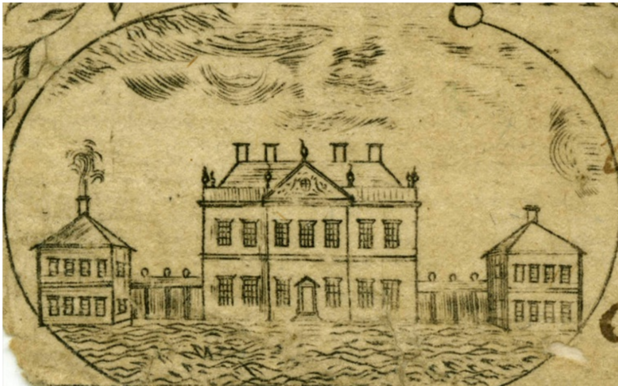
Detail of a 1775 North Carolina five dollar bill, showing Tryon Palace.