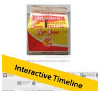
State Symbols Timeline [7]

To read entries about many of North Carolina's most well-known state symbols and the history of North Carolina in Spanish, visit this NCpedia link: https://ncpedia.org/libro-de-hechos-de-el-viejo-estado-del-norte [6]