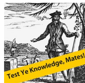
Take a NC History Quiz! [8]