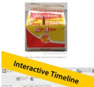
State Symbols Timeline [7]

To read entries about many of North Carolina's most well-known state symbols and the history of North Carolina in Spanish, visit this NCpedia link: https://ncpedia.org/libro-de-hechos-de-el-viejo-estado-del-norte [6]