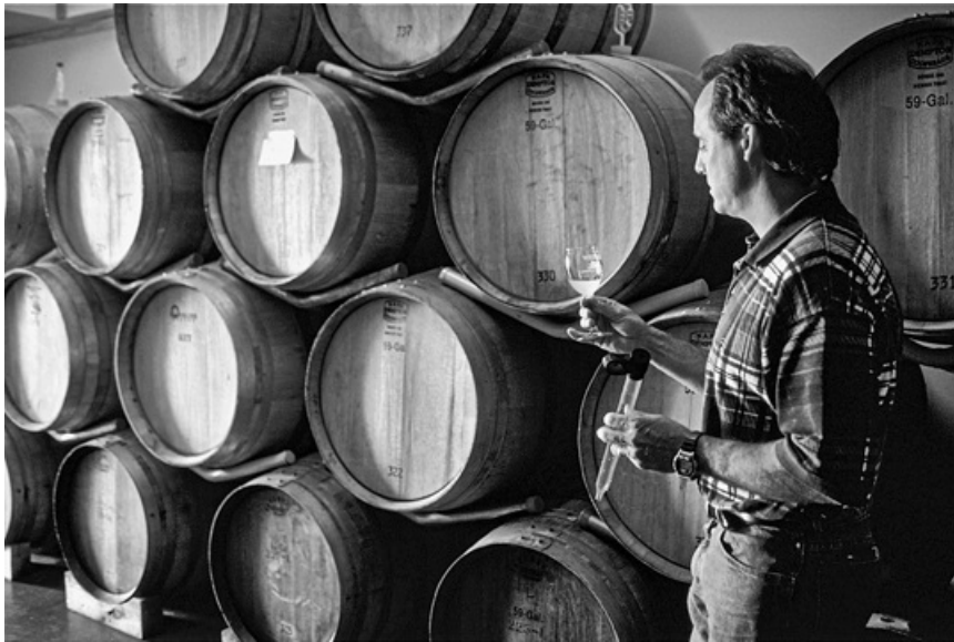
Sampling wine at Westbend Vineyards near Winston-Salem.