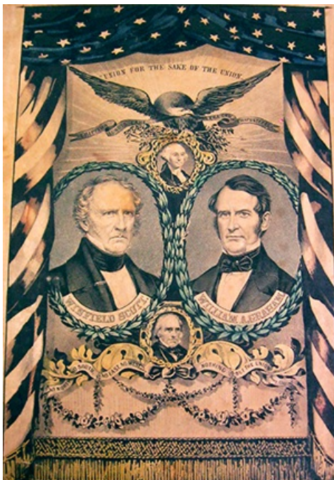
Presidential campaign poster for the Whig Party, 1852, with portraits of Winfield Scott and William Alexander Graham.

After declining European diplomatic appointments offered by Zachary Taylor, Graham agreed to become secretary of the navy in July 1850, when Millard Fillmore formed a cabinet that supported the proposed compromise measures then before Congress. Initially his role was largely political, as he promoted passage and acceptance of the Compromise of 1850. He viewed the compromise as the final resolution of long-standing sectional controversies. To both North and South he advocated moderation, advising the North that faithful execution of the Fugitive Slave Law was essential to perpetuation of the Union. Although he knew little of naval affairs and never fully grasped the significance of contemporary technological advances, Graham was an experienced administrator. He relied heavily on knowledgeable advisers such as career officer Matthew Fontaine Maury [24] . Secretary Graham was the moving spirit in several notable activities including a constructive program of personnel reforms, exploration of the Amazon basin, and the Perry expedition to Japan. The authoritative naval historian Samuel Eliot Morison [25] has characterized Graham as one of the best navy secretaries in the nineteenth century.